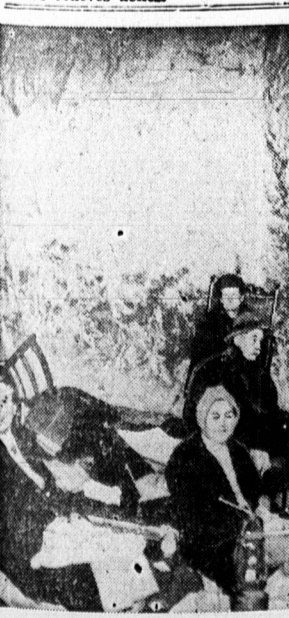
Sazi air raids on Britain have not been confined to London. So civilization in the English countryside turns back thousands of year as man again seeks the safety of a cave. The cave above, in Kent, was formerly used in brick making. Now it's ventilated, soundproof and bombproof.

DETROIT, Oct. 21—(CP)—The camp of Detroit Red Wings broke up officially today with Jack Adams, the team's manager, putting his stamp of approval on the club's personnel and the farm-club players as "the best looking crowd of players I have ever seen assembled."