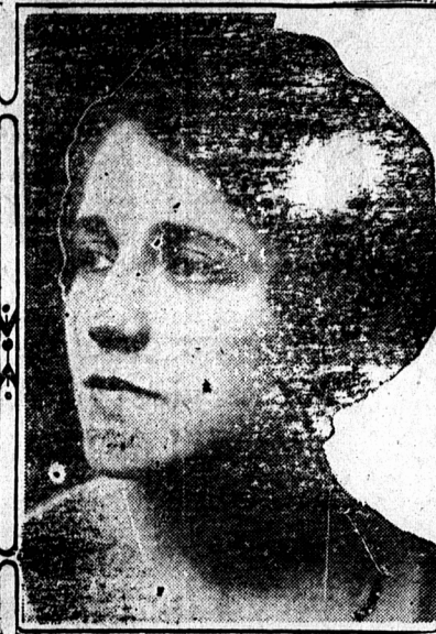
Aug. 13. Minister of militia during the war years and a captain of fin- ance Sir Edward was greatly beloved throughout the Dominion. The end came with startling suddenness. Lady Kemp, who is shown above with Sir Edward, was with him at the end.