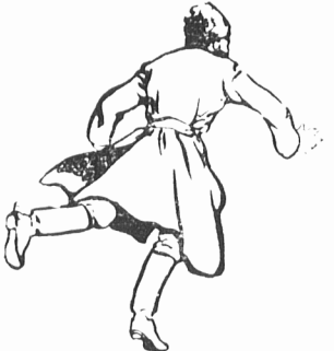
And the Russians retired.