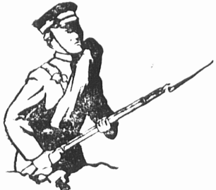
It's "To Arms," with the Jap,