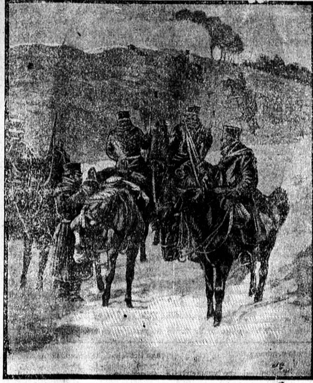
JAPS MAPPING OUT MOUNTAIN PASSES. In all field work the Japanese have shown that the Russians are working along antiquated lines as compared with the yellow men opposed to them. The inability of the Russians to prevent the occupation of vital points in their own lines, almost invariably in rear or flanks, by the Japanese, has dumfounded their adherents in European capitals more than any other feature of the land operations.