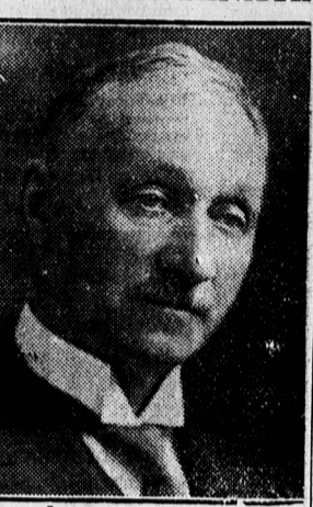
HON. J. A. ROBB Acting Minister of Finance who led the fight in the Lower House against the action of the Senate in amending a bill to provide compensation for Home Bank depositors. Mr. Robb's resolution of non-concurrence is virtually a declaration of war against the senior chamber.