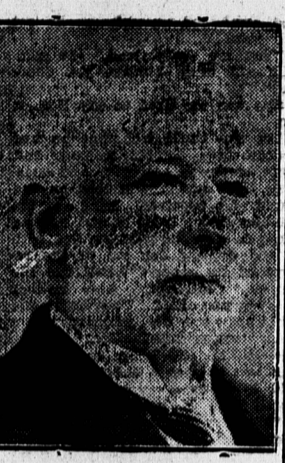
Estimates tabled in the House of Commons provide for an annuity of $10,000 for Rt. Hon. W. S. Fielding the veteran Minister of Finance, who will be forced through ill-health to resign his post.