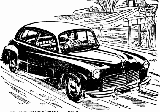
GET YOUR MONEY'S WORTH... GET A

For the convenience of Hillman owners, a permanent network of dealers provides parts and service from coast to coast in Canada and the U.S.A. Arrange now with your dealer for a Hillman demonstration ride!