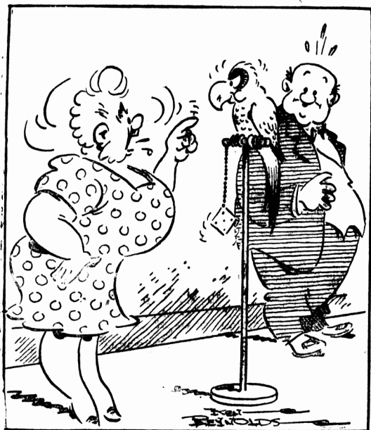
"The next time you side in with my husband—you'll be in the Guardian Want Ads looking for a new home!"