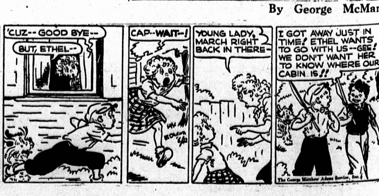
By George McManus

As they screamed down in a long dive massed anti-aircraft guns along the beach and on every ship for a mile around opened up. It sounded like a thousand and one rivetting machines.