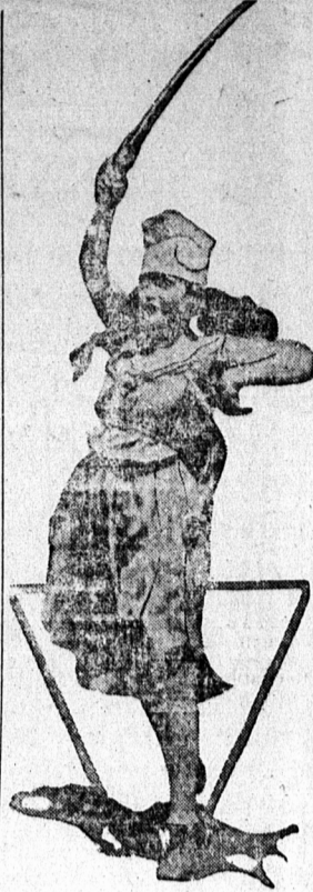
VALENTINA CHEVOLIER in "SCARAMOUCHE"