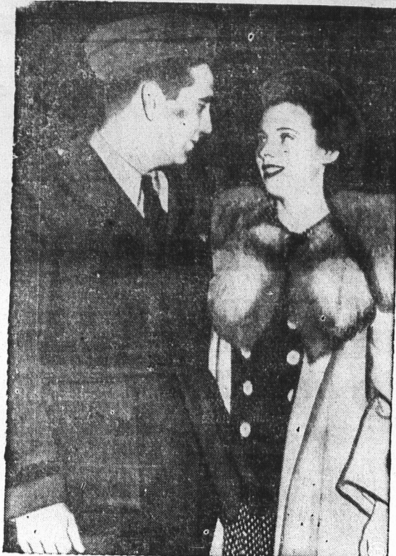
Their expressions tell this story as Lt. Edward P. O'Hare and his bride of seven months meet in Phoenix, Ariz. for the first time since the war's start. Lt. O'Hare, Navy pilot who shot down six Jap planes during raid on Gilbert Islands in on "vacation" en route Hawaii to Washington, to which he was ordered.