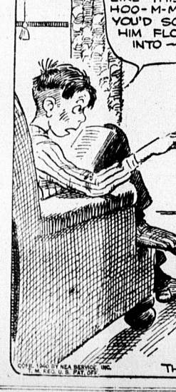
THE WINGS OF SONG