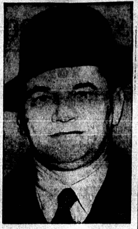
K. T. Jutila, above, former Finnish minister of agriculture, has been approved by Washington as Finland's new minister to the U.S. The White House sent to the Senate the nomination of Maxwell Hamilton to be U. S. minister to Finland in re-establishment of diplomatic relations broken in the summer of 1944.