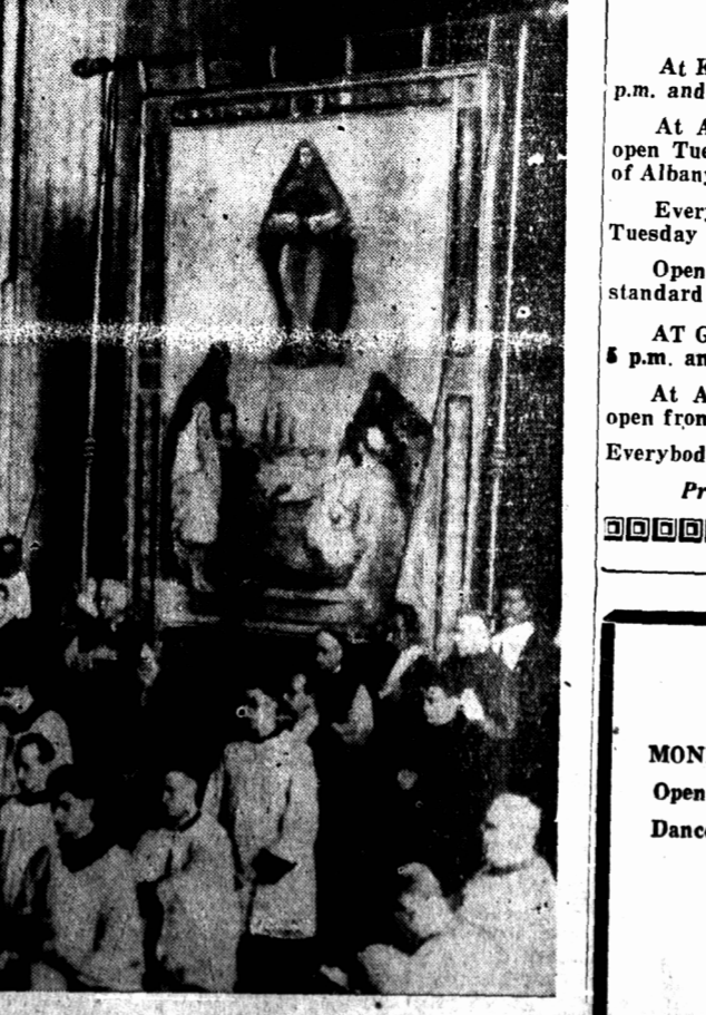
The banner of Mother Francesca Cabrini is carried into St. Peter's in Rome during the solemn and colorful ceremony July 7, at which the gentle nun became the first American to be elevated to sainthood.

!! NOTICE !! Don't Forget to Keep MONDAY NIGHT JULY 15th. Open - Attend the Big Dance - in BORDEN in the LEGION HALL Sponsored By The Borden Tennis Club Good Time - Good Music HUBBA - HUBBA