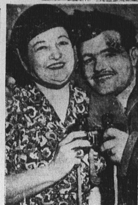
HOME FROM THE WAR

Women who suffer painful, irregu- lar periods should use Lydia E. Pinkham's Vegetable Compound very effectively to relieve such distress. Pinkham's Compound is made especially to help such weak, tired women during difficult days. Thousands of women have reported remarkable benefits. Made in Can- ada. WORTH TRYING! Any drug- store.