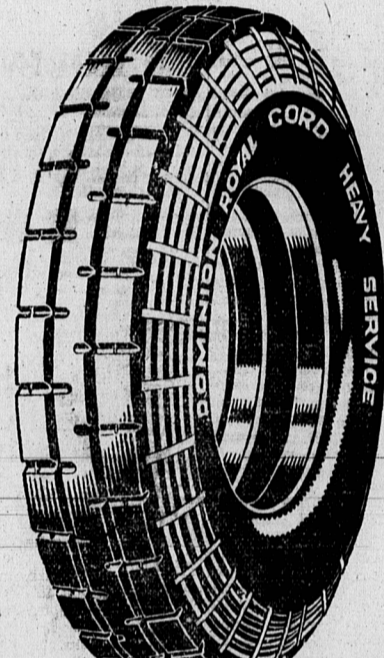
Note the ribbed wall construction which protects the side walls against wear and side-scuffing from curb or deep rut. "Usconite," the new rubber compound prevents tread and carcass separation. Read about it in the paragraph at the right.

It maintains its tenacious characteristics under high temperatures. It has a strong affinity for cotton, making the plies hold firmly together, and preventing tread and carcass separation. Yet, it permits great freedom of movement in the carcass. Only Dominion use "Usconite".