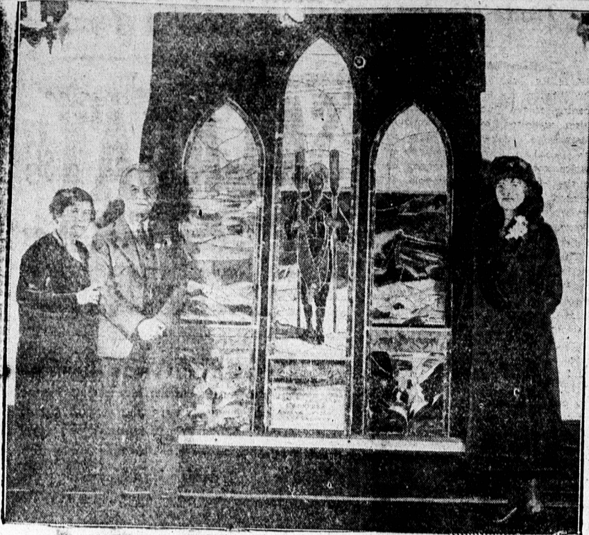
TO BE PLACED IN CHURCH AT ST. ANTHONY, LABRADOR