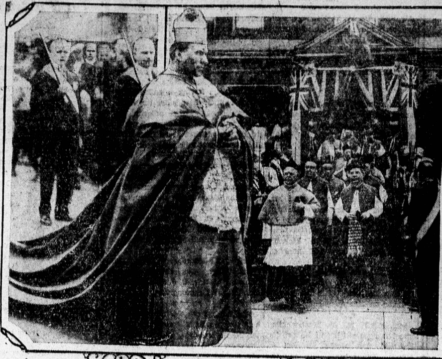
ECCLIASTICAL POMP AND DIGNITY FEATURE OF CONSECRATION OF CHARLOTTETOWN BISHOP IN HAMILTON.