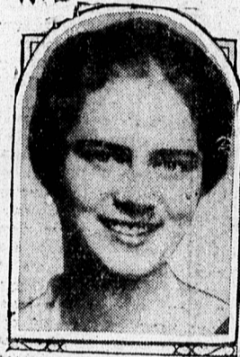
WILL BE JUNE BRIDE