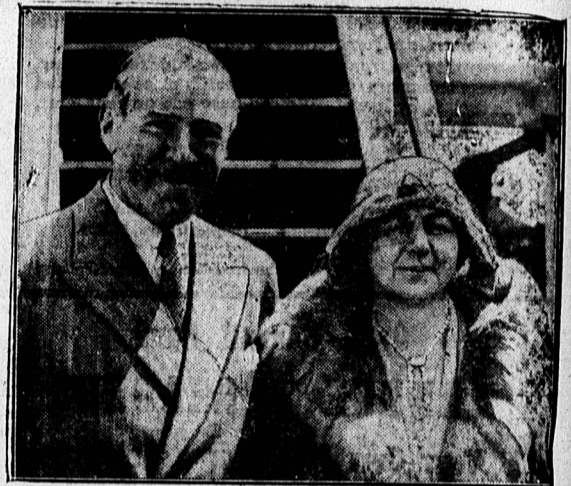
AT INVITATION OF MAYOR OF NEW YORK