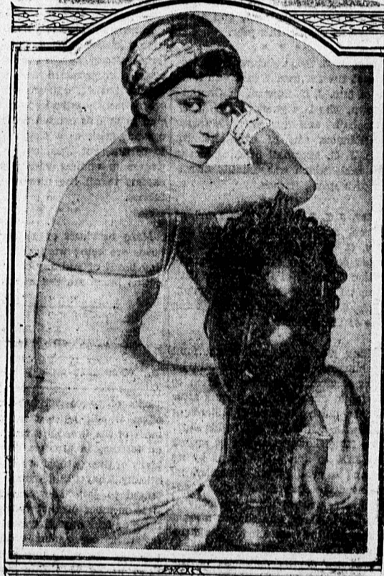
TO DANCE FOR KING CAROL

Princess Ioana of Roumania is to marry Archduke Anton von Hapsburg in June, it has been officially announced.