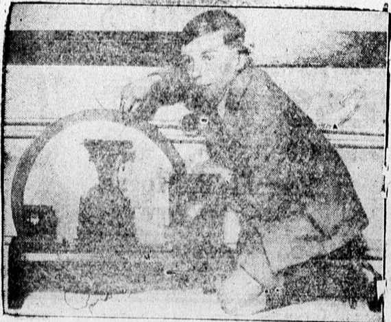
RECEIVED BROADCAST FROM AMERICA

Edwin Thompson, Lord Mayor of Liverpool, England, and the lady mayoress, who are visiting the United States at the invitation of Mayor Walker, arrived in New York aboard the S. S. Britannia. Photo shows the lord and lady mayoress of Liverpool as they arrived.