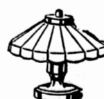
TABLE LAMPS We have a fine assortment of Table Lamps, practical and attractive.

Come in and see our brilliant display of Electrical Equipment, gifts that will adorn and brighten your home.