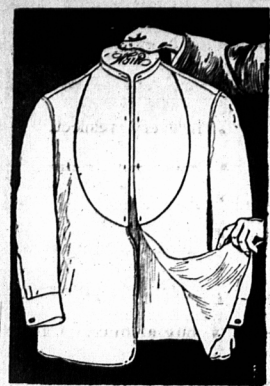
W.P.B. Coat and Shirt

TORONTO, Feb. 8.—At the meeting of the Industrial Exhibition Association the financial statement showed receipts from all sources of $182,163.54.