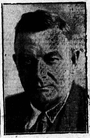
HON. G. SHELTON SHARP

OTTAWA, March 11.—Canadian industry will have a period of three months in which to adjust itself before the Federal eight-hour day and 48-hour week legislation becomes effective, Labor Minister Wesley Gordon announced tonight in the House of Commons. Although the act will become operative as soon as passed by parliament, three months will elapse before penalties will be assessed for infractions.