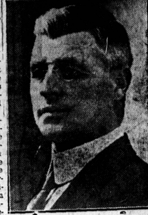
Minister of Defence in the Meighen Government, who during the time when the Progressive party was debating its position between the two old parties, announced that, if called upon to form a government, Mr. Meighen would carry on without a new appeal to the people.