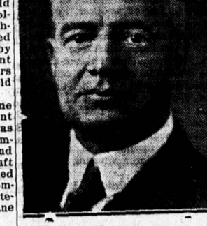
Well known prohibition worker, who became Managing Director of the Canadian Prohibition Bureau, the formation of which has just been announced. The bureau will have Dominion-wide scope.