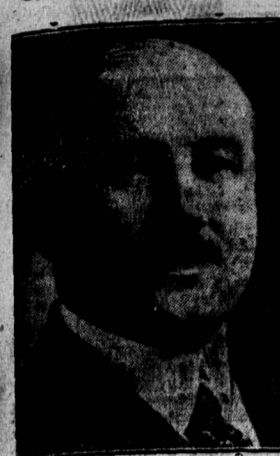
Former Mayor of Toronto, who presided at an important meeting of the Great Lakes Harbor Association in Detroit. He declared there is no possible compensation for the Chicago water steal.