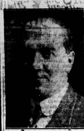
Elected by the constituency of Queens, and who is sitting in the new Canadian parliament. His home is in Charlottetown, P. E. I.