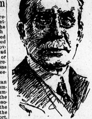
Henry Berenger, who is about to take up his duties in Washington as French Ambassador. He will make an attempt to settle the French war debts.