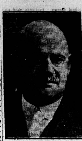
Member of the Ontario House for Port Arthur, who is the Canadian delegate at a conference in St. Paul, Minnesota, of the Great Lakes-St. Lawrence Tidewater Congress.