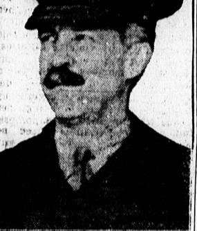
Chief of the Ontario provincial police which is engaged in a controversy with the Toronto police over the enforcement of the dry law on New Year's Eve.