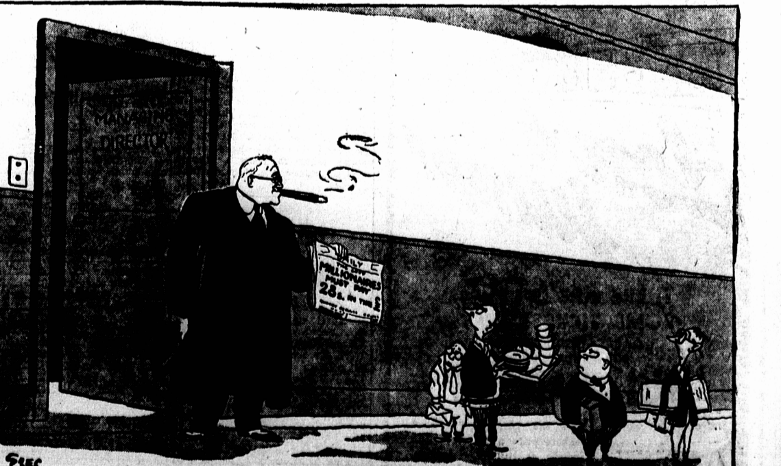
Just in case there are any would-be office boys-to-be among you...