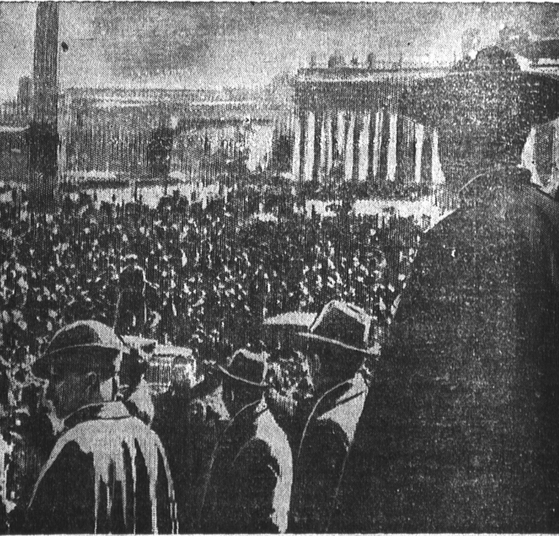
Framed between the silhouetted figures of two priests is seen part of the crowd, estimated at 250,000 persons, that jammed the square before the Vatican and cheered the announcement of Papi Secretary of State Eugenio Cardinal Pacelli's election to the Papacy. The new Pope will reign as Pius XII.