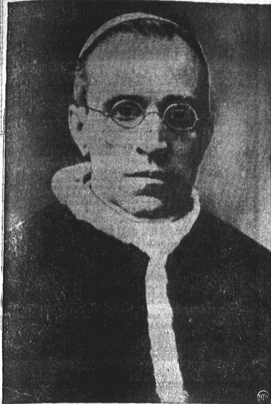
The new elected Pope Pius XII is shown in the radiophoto above as he looks in his pontifical robes. It is a composite photograph, made by the official Vatican photographer immediately after the election.