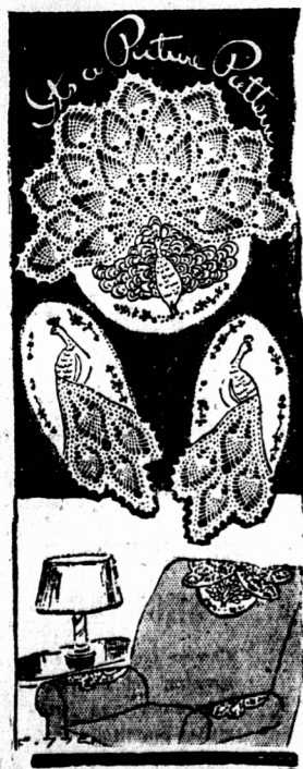
DESIGN NO. E-772

This good looking chair set is a combination of crochet work and embroidery. Just look at the photo or read detailed instructions to crochet the popular pineapple pattern which forms the beautiful fan tail. Needlework Book 20 cents.