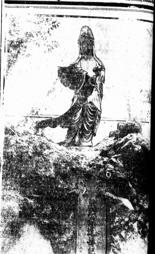
Photo shows the memorial statue erected in Tokyo in memory of the victims of the great earthquake and fire which swept kyo in 1923.