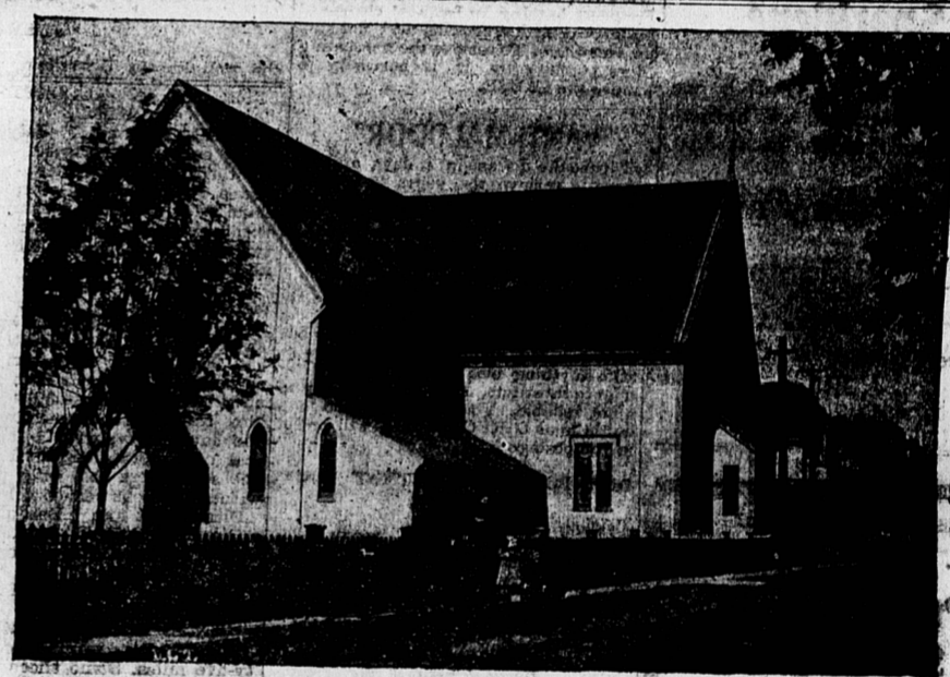
GRACE CHURCH, Charlottetown.