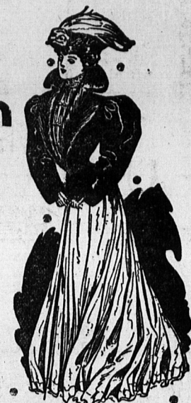
MUSK-OX BRAND FURS

These garments are made of the finest animal skins, are beautifully lined with rich, heavy fur and are quite a new, interesting and novel design. The latest style sleeves and are the best fitting garments produced in Canada today.