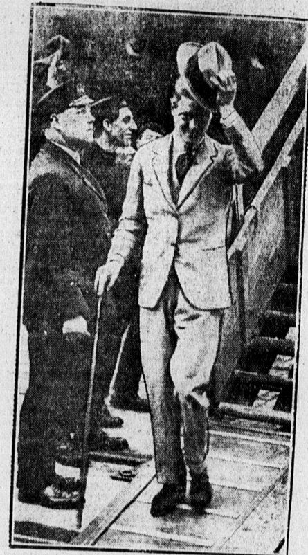
Lord Renfrew, Prince of Wales, has been welcomed back to England after an absence of several months in Canada, where he visited his E.P. ranch in Alberta. He is seen stepping on the landing stage from the liner