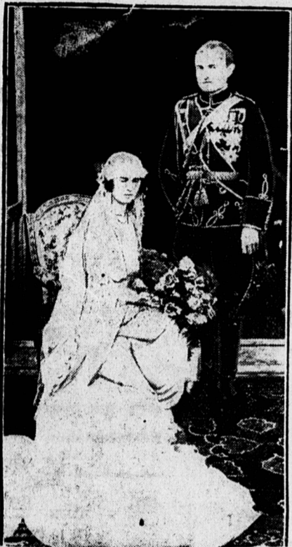
Great pomp and ceremony attended the wedding recently of Prince Paul of Serbia and Princess Olga, daughter of Prince and Princess Nicholas of Greece in Belgrade. The photograph was taken following the ceremony