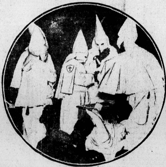
Under the flare of torches, two couples dressed in the regalia of the Ku-Klux-Klan were married simultaneously at Brielle, N.J. A crowd of nearly 10,000 witnessed the wedding