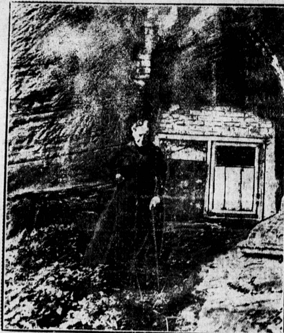
A remarkable colony of modern cliff dwellers has been found in Worcestershire. The homes are built in cliffs of red sandstone and consist of dwellings of five to seven rooms. Windows and doors are hewn out of the rock