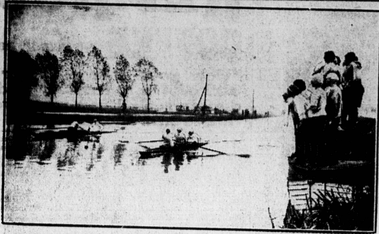
Ladies are taking up rowing in earnest as a new field of sport in England. Girls of the Cecil Club view the racing of their crew in a regatta at Lea Bridge from a point of vantage