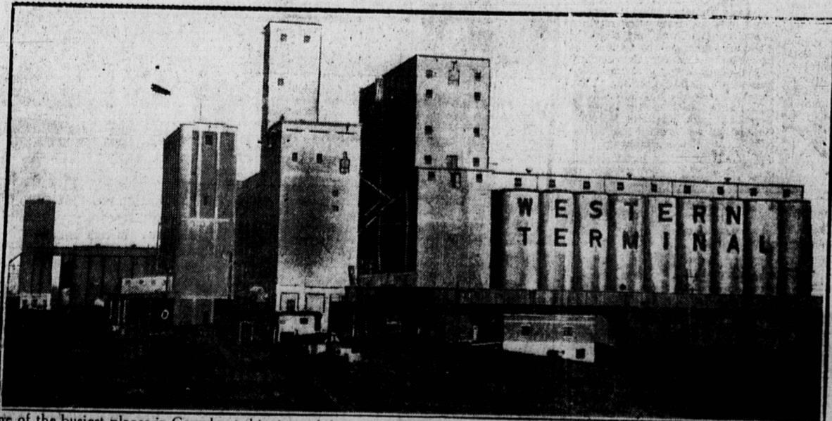
One of the busiest places in Canada at this time of the year is the "mile of elevators" at Fort William where trainload after trainload of western wheat is daily deposited in the huge bins for future distribution