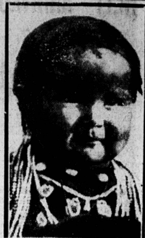
The reservation flapper smile is shown by this little Indian babe. Perhaps you will recognize her as one of those who visited the summer resort during the holidays