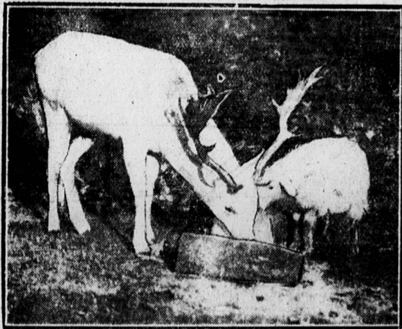
A trip through High Park, Toronto, is a course in zoology. The latest addition to the animal enclosures are three white fallow deer. If they were natives of Canadian forests they might be called the Ku-Klux-Klan of the woods