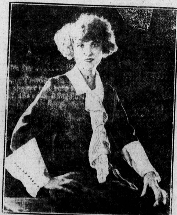
Lace and ruffles about the collars and cuffs are coming back into favor. An attractive style is made of cream-colored satin with pleated chiffon jabot and gauntlet cuffs with chiffon ruffles