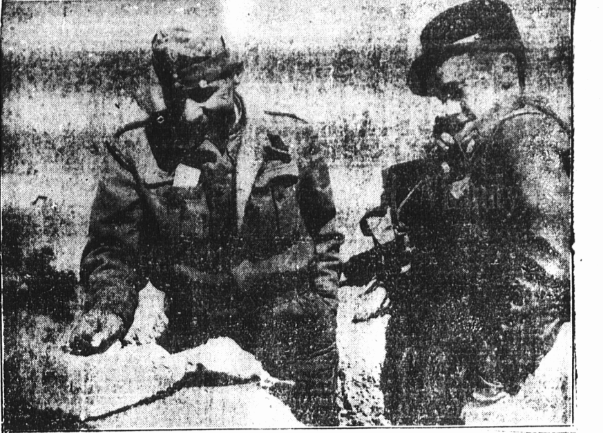
FIGHTING FRENCH AND POLISH FORCES MEET

GLASGOW, Sept. 28—(CP)—The best time to seed a new lawn is from the latter part of August to the latter part of September. Select the right type of grass seed and a good food to strengthen grass so it will fight other grasses and weeds. Overcooking causes fish to break apart and lose its flavor. Fish steak, cut about an inch thick, takes approximately 20 minutes to cook.