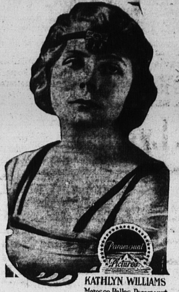
KATHLYN WILLIAMS

LAST CALL TO SEE THIS SPLENDID FEATURE KATHLYN WILLIAMS IN "Redeeming Love" A wonderful representation of the histrionic ability possessed only by the foremost stage or screen stars is exemplified by Kathlyn Williams in "Redeeming Love". First she plays the innocent young beauty in the quiet country town and then the blase brilliant woman of the world who reigns supreme in her own reckless sphere. The story is elaborately staged and has an exceptionally strong supporting cast.