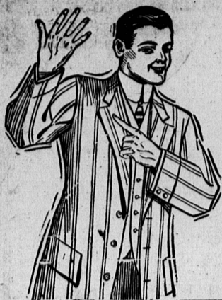
"The Home of Good Hats"