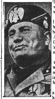
Expectations of an imminent Italian move in the Adriatic were heightened by a conference at Innsbruck, Germany, between General Alberto Pariani, chief of Italy's General Staff, and Col. Gen. Wilhelm Keitel, chief of the High Command of the German armed forces.

Fascist Troops Ready To March At Any Moment