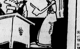
"Come home and break bread with me tonight, old man?" "No, thank you. My wife does her own cooking, too."