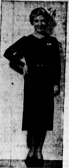
Laura La Plante