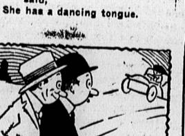
"That chap coming in his auto must be a politician." "Why so?" "Don't you notice the way he is throwing mud?"

TOO MUCH Her eyes dance, her feet dance, Her heart must dance—she's young— But we'll not wed, because, 'tis said, She has a dancing tongue.