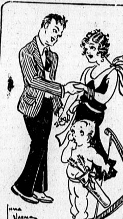
"A couple's pose is usually shot in the presence of an arrow-minded third party."