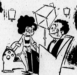
Miss Sweet: Weren't you awfully frightened the first time you went up in an aeroplane? Aviator: Well—er—for a while I did feel a sort of groundless apprehension.

TOO MUCH Her eyes dance, her feet dance, Her heart must dance—she's young— But we'll not wed, because, 'tis said, She has a dancing tongue.