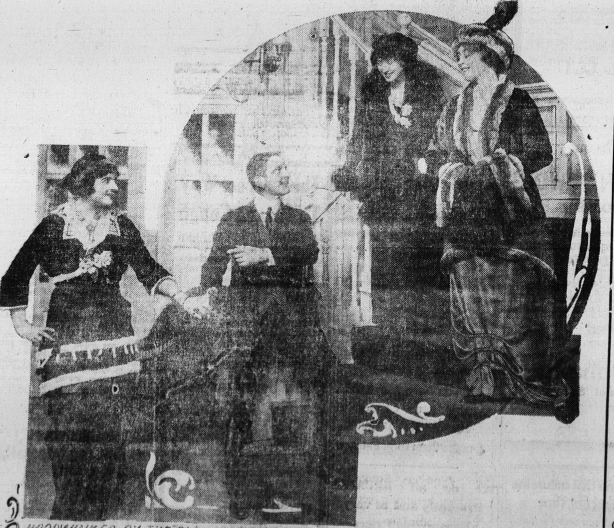
HOODWINKED BY THE PLAUSIBLE STORY INVENTED BY TO ALLAY HIS SUSPICIONS, MAGEE UNWITTINGLY FOR THE $200,000 GRAFT-MONEY.