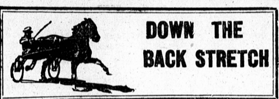
(Continued from page 6)

will give the directors greater encouragement for another year, and perhaps a bigger program will be put on in 1936.