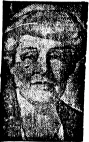
SHOWS LACK OF COMMON SENSE

DEAR MISS DIX: I am a boy in the army. Am engaged to a sweet girl and I want to marry her when I can make enough to support her and be situated so that we could be together. But she insists on getting married right now. She hounds me about it all the time and cries and says I don't love her when I tell her we've got to wait. So I don't know what to do. I don't want to lose her, but I can't marry her now. Do all girls do all this insisting about getting married? We boys would like to do the persuading, and we don't want to be rushed into a marriage before we are ready for it. A WORRIED SOLDIER.