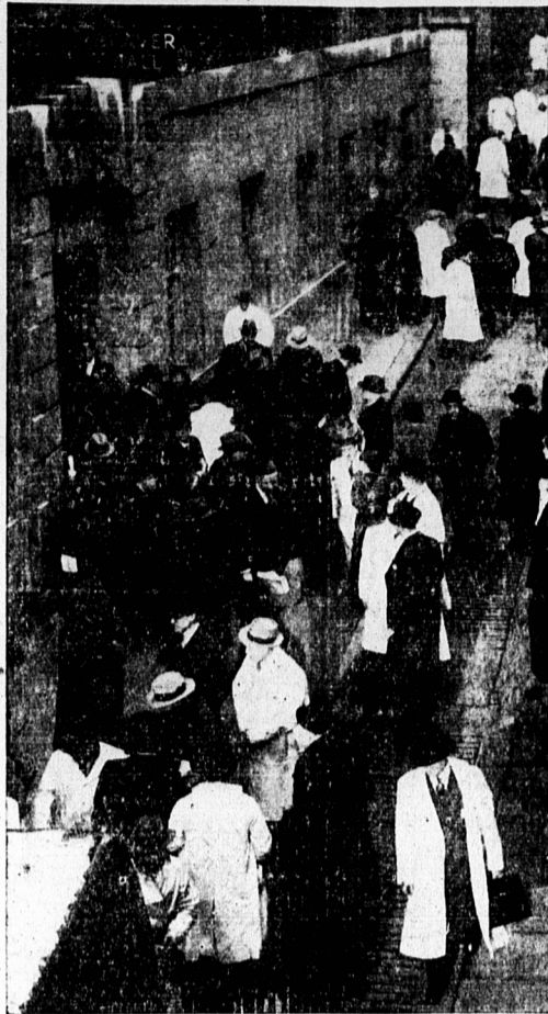
Entrance to Hudson's Bay Warehouse