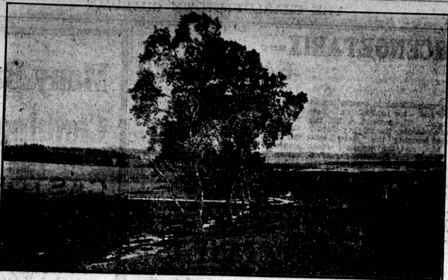
A PRETTY SCENE NEAR CHARLOTTETOWN.

The Charlottetown Guardian has secured the right to use the International Newspaper Bible Study Club Lessons each week for the term of one year, commencing with the lesson for August 23rd, 1908. But one paper in each town can use these. The Guardian takes pleasure in being able to present to its readers such a valuable help along the lines of Bible study. The Morning Daily and the Rural Daily, only paid-in-advance subscribers to either paper are eligible to join this club. There is no fee for entrance, and no conditions other than those stated below. Everybody stands the same chance and has the same opportunity to get the valuable prizes without the investment of a cent. There is one condition that must in every case be complied with and that is, that every one entering the contest must be a regular subscriber as above.