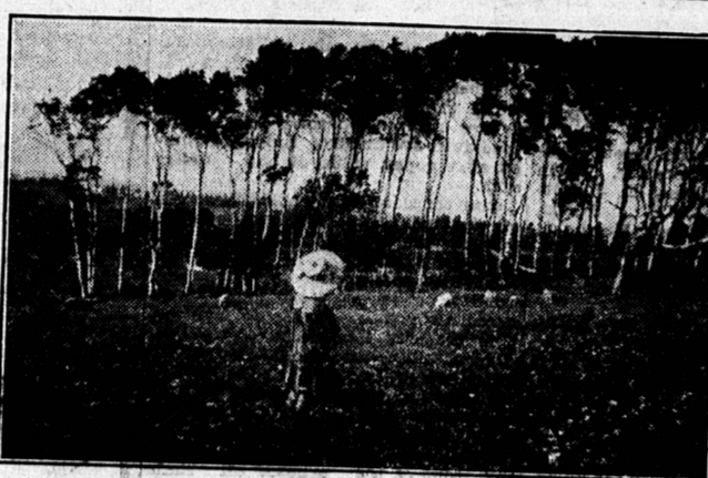
ARTISTIC SCENE AT ELTON.