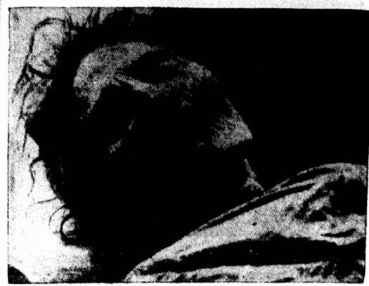
Emaciated by hunger this poor Greek woman lies dead in the streets of Greece, her only crime that she was a Greek living helplessly in the country before it was occupied by Germany.

Contributions by Canadians to the Greek War Relief Fund will help send food to Greece to prevent such horrors as this.