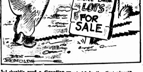
"I should've used a Guardian Want Ad in the first place!"