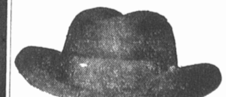
THE BOSTON TOURIST