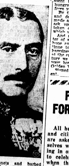
German bayonets and barbed wire surrounded Anallenborg Palace, Copenhagen, home of Denmark's King Christian X, above, and the royal family, following pitched battle between Danish police and German troops.