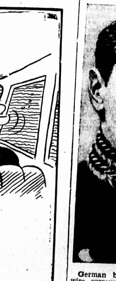
German bayonets and barbed wire surrounded Anallenborg Palace, Copenhagen, home of Denmark's King Christian X, above, and the royal family, following pitched battle between Danish police and German troops.