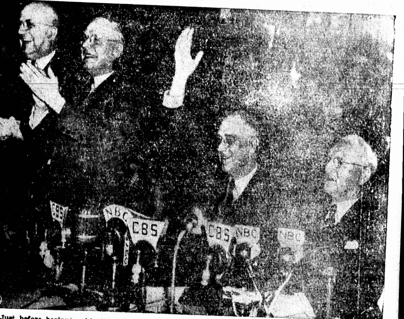
Just before beginning his first outright political speech of the Presidential campaign, President Roosevelt waves a greeting to members of the International Teamsters Union, assembled for a dinner at Washington. ...