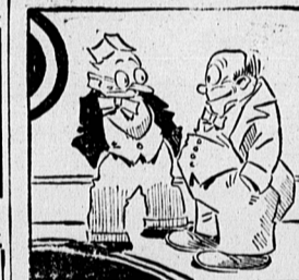
"Why don't you insist on being the head of the house?" "I am the head of the house but my wife says a head is no good without brains."

Once more the breezes whisper soft That spring is here to stay; Once more the skies are blue aloft And flowers are blossoming gay, And yet a note of discord drear Sweeps through the song sublime With fretted ear you seem to hear "It's almost moving time."