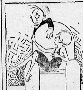
He: Haven't you just one little kiss to spare me? She: Well, I must admit I'm rather short of them this week. My wife gave a whole lot away already.