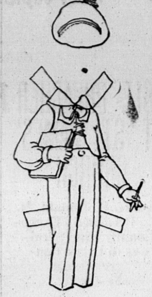
DAVID'S HAPPY HOME

This is the second day's chapter of the famous story of "David Copperfield." Children who follow this story and cut out the paper dolls every day will have a complete set of David Copperfield dolls with which to act out the story.