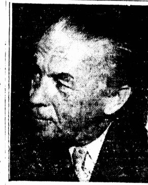
The Late Count Bernadotte