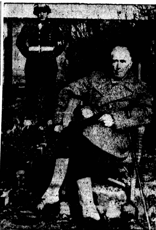
One-time ace diplomat of Germany, Franz von Papen, seen here under U. S. guard, has been sentenced to eight years in a labor camp and barred from public office for life by a German denazification court. Four months ago the 66-year-old Nazi was acquitted of major war criminal charges by the Nuremberg international tribunal.