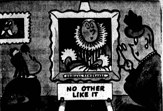
NO OTHER LIKE IT