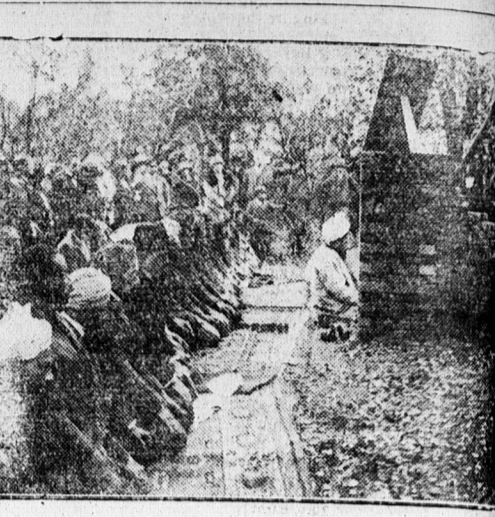
A MOHAMMEDAN MOSQUE FOR LONDON The Faithful at prayer during the ceremonies in connection with the laying of the corner stone for the first Mohammedan mosque in London. The stone was laid by His Holiness the Khalifa Masih, head of the Ahmadiyya Community, seen kneeling down the right.