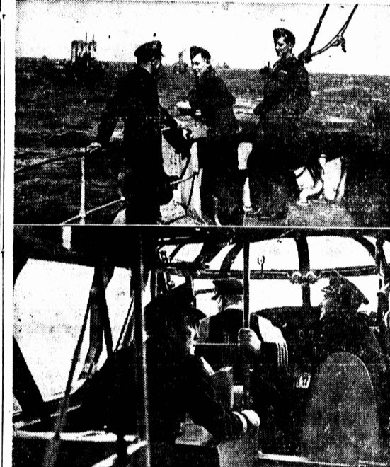
FLIERS SAIL AND SAILORS FLY TO LEARN EACH OTHERS JOB

A new scheme of liaison between officers of the Royal Air Force and the Merchant Navy has brought about another strange war-time twist in jobs. From planes of air convoys skippers of cargo vessels study the tactics of airmen protecting their vessels while, on the water, airmen from the decks of merchant ships learn the routine and difficulties from the seamen's point of view. In this way each gets a realistic idea if the other's work and co-operation between convoys and protecting aircraft is facilitated. In top picture an officer of a Merchant Navy vessel takes time out to talk to his two R.A.F. guests, who have been watching the line of hips stretching up the Channel. Below, two Merchant Navy officers up with the pilot of an R.A.F. plane keep a sharp watch on other escorting aircraft.