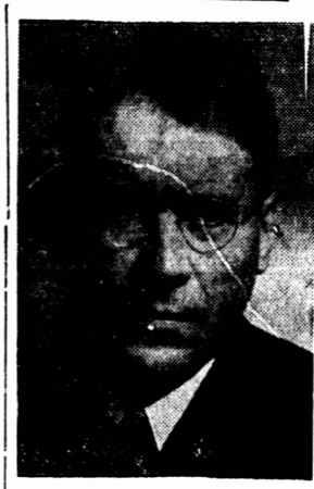
FINANCE MINISTER ISLEY